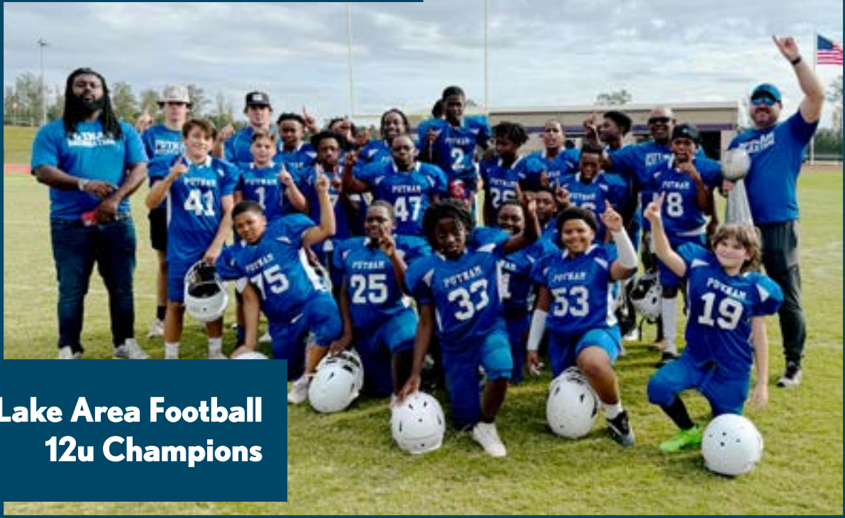
2024 Lake Area Football 12u Champions