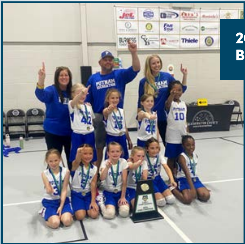
2025 GRPA Class C Girls 8u Basketball State Champions